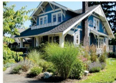
Qandaraaslayaasha RainWise waxay dejiyaan naqshada beeraha roobka ku baxa ee ku habboon baahiyaha gaarka ah ee goob kasta.

Waa maxay dhibaatabadu? Roob kasta oo da'a, roobku wuxuu wasaaqda ka soo qaadaa saafayadeena, wadooyinka la maro iyo meelaha kale ee adag dushooda isaga oo gala webiyada yar yar ee degaankeena, Lake Washington and Puget Sound. Inta lagu jiro roobkaa waaweyn, heerka 'biyaha roobkan' wuxuu keeni karaa buux-dhaafka bulaacada, isaga oo nabaad guurin kara meelaha taagaga ah iyo iyo hareeraha dooxyada. Beeraha roobka ku baxa iyo taangiyada biyaha lagu keydiyo 'cisterns' waxaad caawimaad ka geysan karaan maareynta biyahan roobka marka aad wax caawiso.