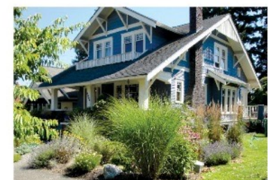
ទំនាក់ទំនង RainWise ដើម្បីស្វែងរកសេវាប្រឹក្សា និងការគ្រប់គ្រងទឹកភ្លៀសរបស់យើង។

ស្ថិតិប្រកបរបរ អ្នកប្រកបរបរ គឺជាការកែលម្អដីនៅជុំវិញផ្ទះ ដើម្បីធានាថាទឹកភ្លៀសមិនហូរចូលទៅក្នុងប្រព័ន្ធប្រព្រឹត្តិទឹកប្រចាំថ្ងៃនោះទេ ហើយក៏មិនបង្កផលប៉ះពាល់ដល់បរិស្ថានទេ។ ទឹកភ្លៀសដែលបានគ្រប់គ្រងត្រឹមត្រូវ នឹងបង្កើនប្រសិទ្ធភាពរបស់ប្រព័ន្ធប្រព្រឹត្តិទឹកប្រចាំថ្ងៃរបស់យើង និងជួយកាត់បន្ថយថ្លៃប្រើប្រាស់ទឹកភ្លៀសរបស់យើង។