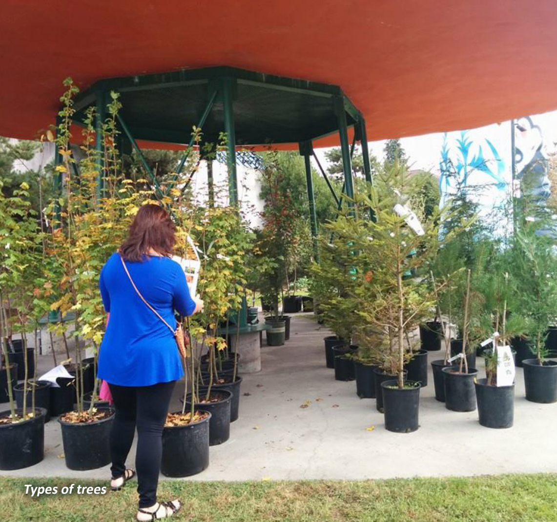
Types of trees