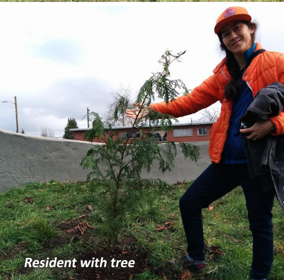
Resident with tree

http://www.sustainableseattle.org/programs/stormwaterdepave/sus-