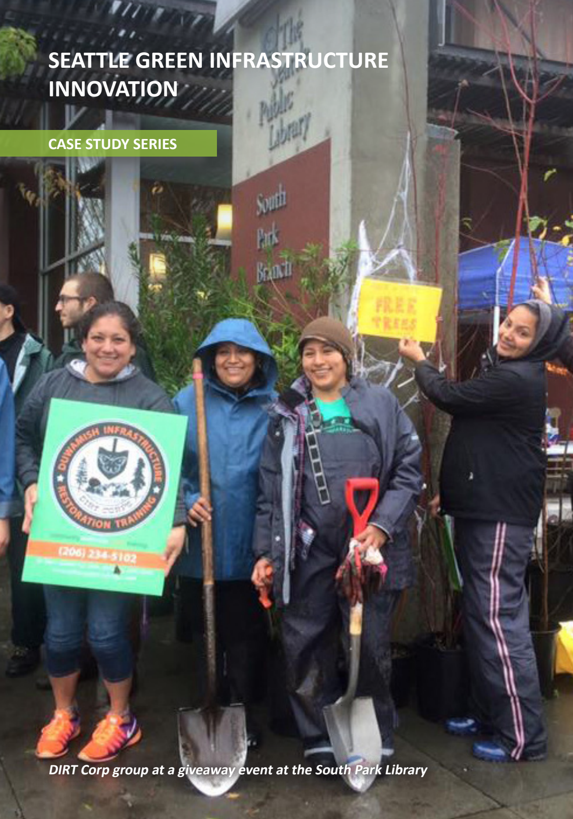
DIRT Corp group at a giveaway event at the South Park Library