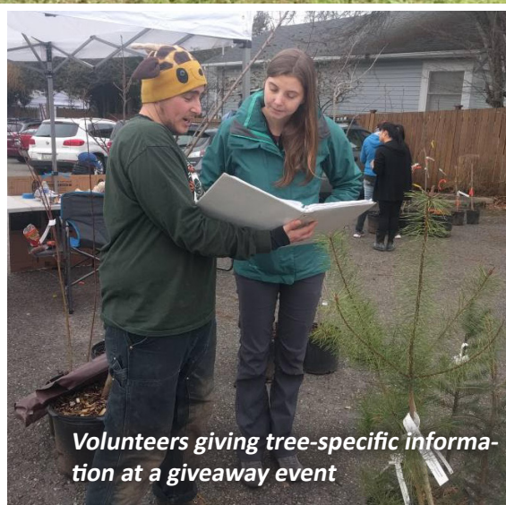
Volunteers giving tree-specific information at a giveaway event