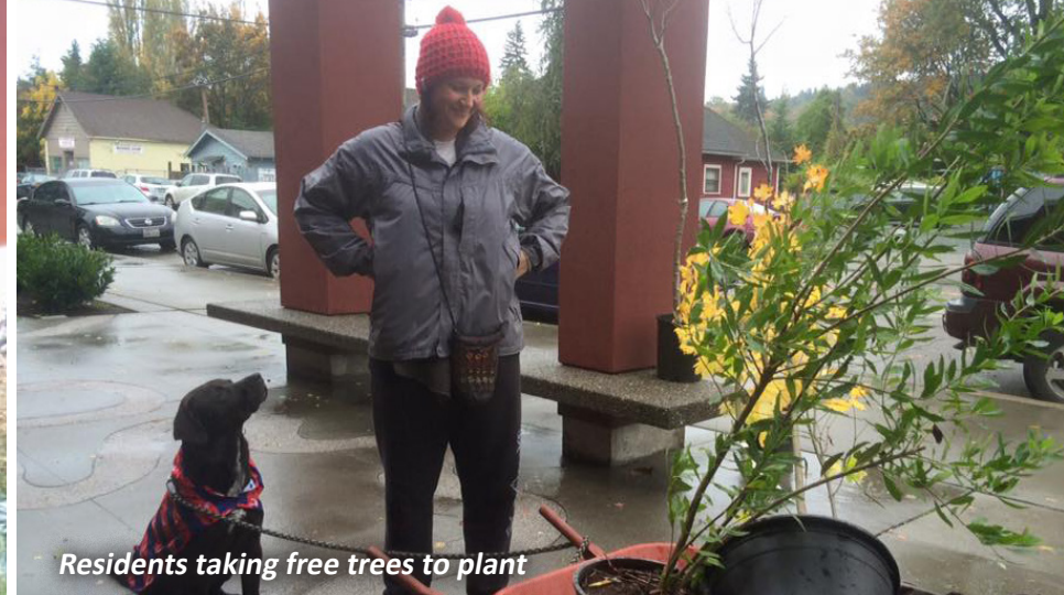
Residents taking free trees to plant