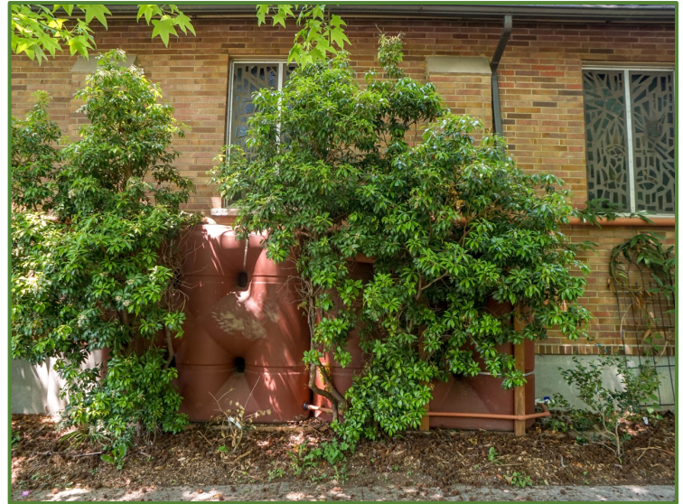
Existing foliage smartly covers some of their cisterns.