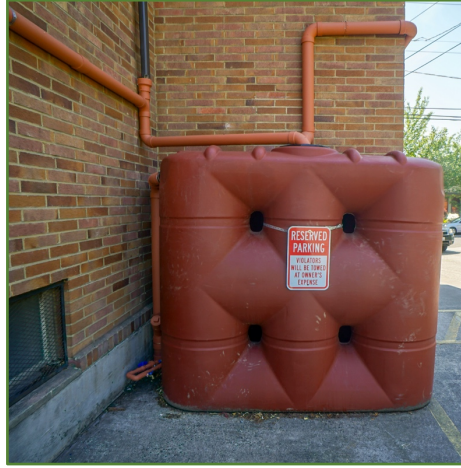
One of the 530-gallon cisterns around the building.