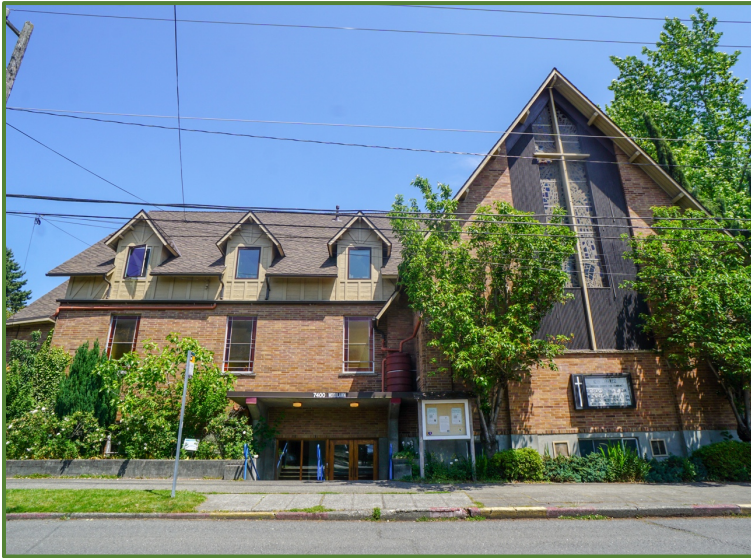
7400 Woodlawn & Emmaus Table are located in the Green Lake neighborhood of Seattle.