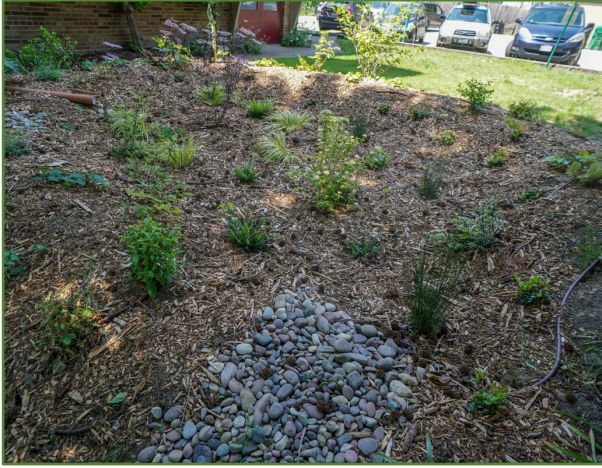
Their newly installed rain garden.

Completed in February 2019, this massive project took RainWise contractor Thriving Garden Design just a few months for construction. The installation comprises of six cisterns that can hold 2,530 gallons of water at a time, along with 70 square foot rain garden. In total, this installation manages an estimated 50,000 gallons of storm water before it enters the storm sewer each year.