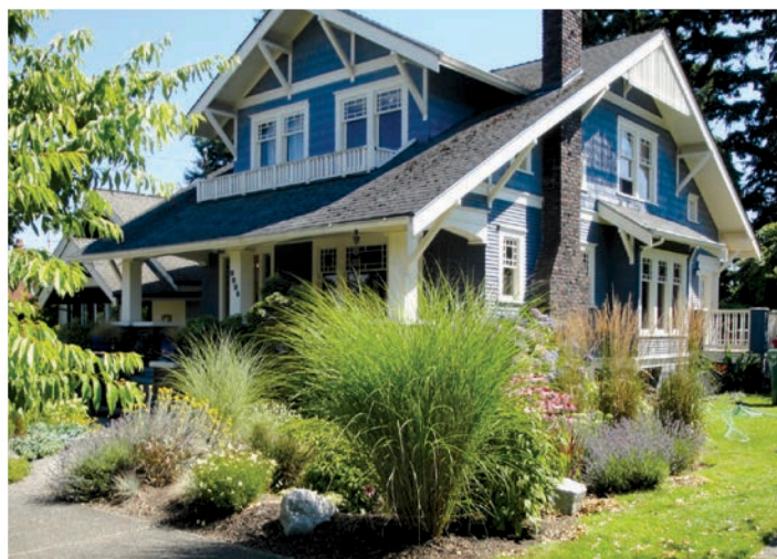
RainWise contractors design rain gardens that fit the unique needs of each site.

Questions? Email rainwise@seattle.gov or call Garden Hotline at 206-633-0224.