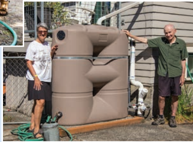
Cisterns come in several shapes, sizes and colors.

A cistern is a large, above-ground container used to collect roof water. It is like a huge rain barrel and can hold 200 or more gallons. During the winter, RainWise cisterns collect rain and slowly release it to the sewer system. In the summer, the water can be collected and used for watering.