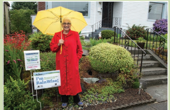
Rain gardens can include a variety of plants and a design of your choosing.

A rain garden is a shallow depression containing spongy soil and a variety of plants. It collects water from your roof downspout and allows it to slowly soak into the ground. The soil and plants act as a natural filter, cleaning the water before it enters the ground or a nearby waterway.